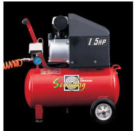
Pneumatic power source 6kg/cm<sup>2</sup>